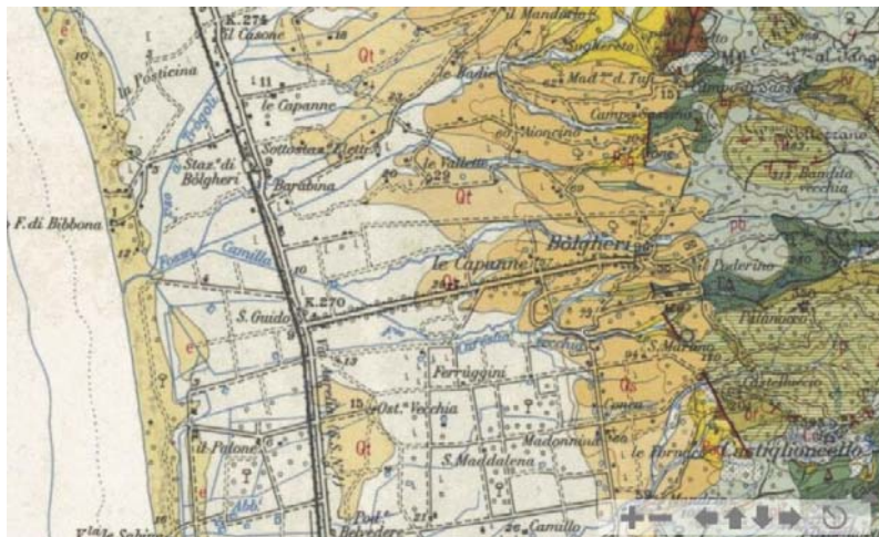
GEOPEDOLOGICAL MAP - Geopedological map of Bolgheri area

The traditional XIX century casa colonica maremmana, or country house, that is depicted on the Ornellaia label, welcomes guests who visit the Tenuta to discover the secrets of the wines produced in an area that has by now become "the cradle of great reds," and as such gained a true territorial identity. On the hills of Bolgheri, home to the appellation, Tenuta Dell'Ornellaia represents a perfect synergy between the quality of the few, but superlative wines, and its hospitality.